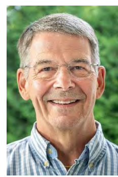
Membership / Promotion