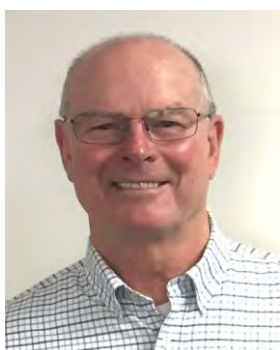
Administrative / Finance